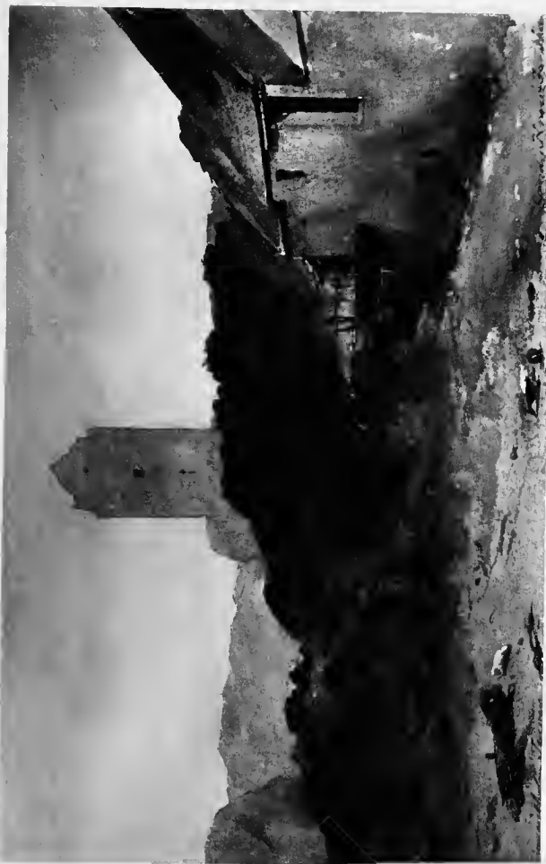
SMAILHOLM & SANDYKNOWE FARM HOUSE FROM A WATER COLOUR BY GEORGE MA'ISON.